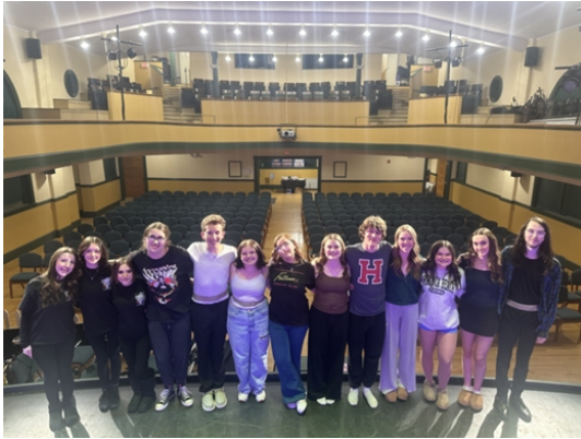
LHS Drama Club Seniors at the close of Footloose The Musical!

To our seniors, the advising team and directors wish you luck in all your future endeavors! We hope that you “break legs” (good luck in theatre terms) wherever life takes you!